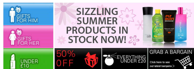
An illustration of default and winning content for a test that reduced homepage exits by 39%